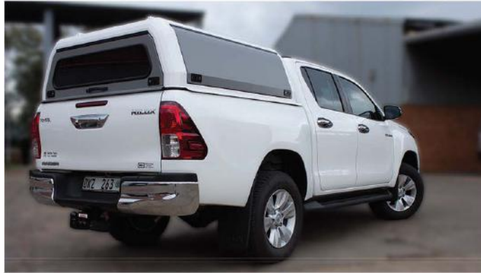
TOYOTA HILUX 2016 + Rhino-Cab