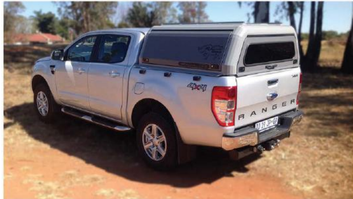
FORD RANGER T6 Rhino-Cab