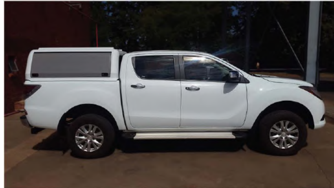
MAZDA BT 50 Rhino-Cab